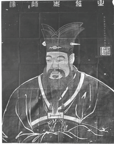
Bust Portrait of Confucius as Minister of Justice in the State of Lu, rubbing of incised stone tablet, dated 1734, Beilin collection, Xi'an, China