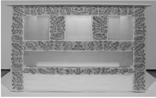
Lineal Conversion , 2009 Red oak, linen, silk organza, embroidery floss 36" x 45" x 19 1/2", a part of installation, "Lineage"