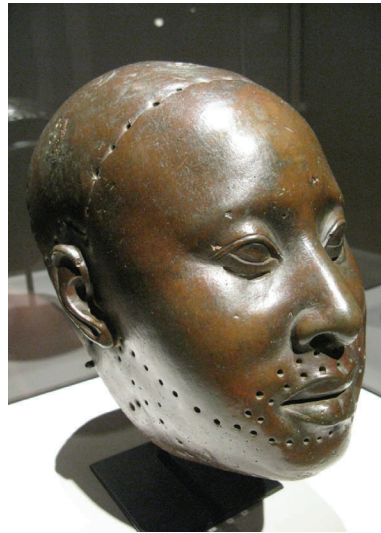
A 13th century copper alloy casting from Ife -- one of 109 works on display in Spain